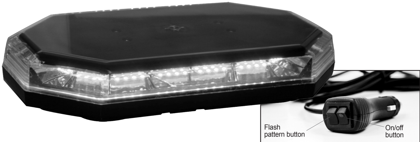
Flash pattern button On/off button